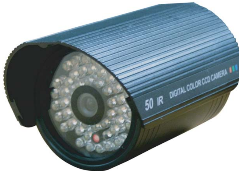
WDB-5603FDN / WDB-5605FDN